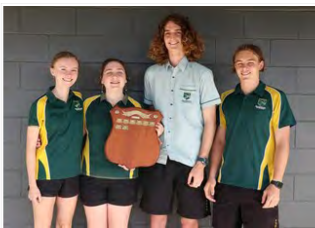
Flinders' Captains and Vice Captains

Congratulations once again to Flinders for being crowned Athletics Day Champions 2022 and to all our Age Champions in their respective age groups.